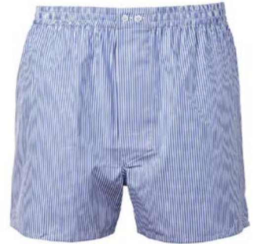
Cotton boxer, available in different fabrics and models, also possible custom-made, 35 Euro