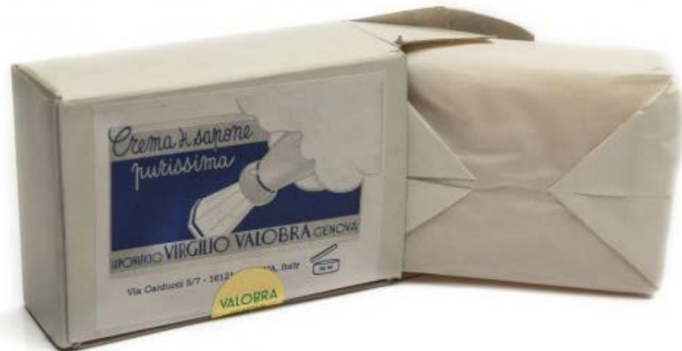
Almond shaving cream soap to be used with shaving brush, 15 Euro