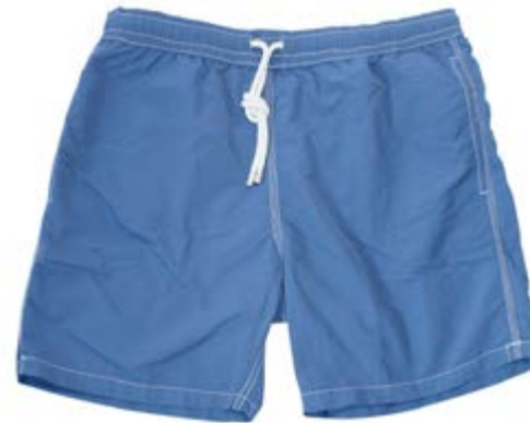
Bathing trunks with waist band and cord, brand name cotton, available in various colors 115 Euro