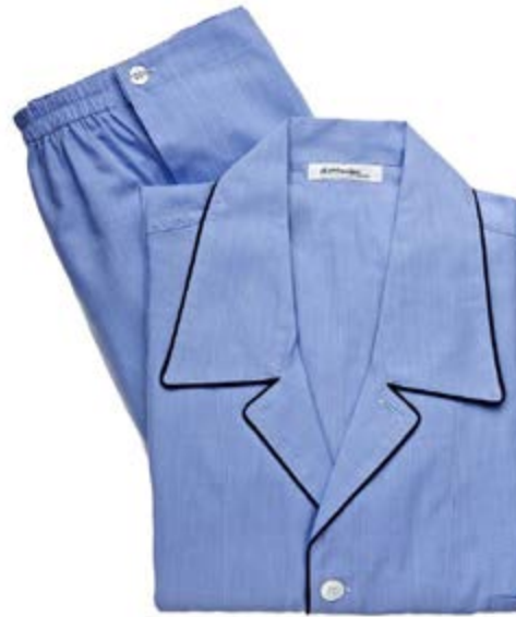
Cotton pajama with contrasting border, available in different fabrics and models, also possible custom-made, 159 Euro.

Free from every social constriction or etiquette, there is always a particular pleasure in pursuing awareness of one's personality and uniqueness. And putting aside philosophy, it is in our privacy that the better part of us comes out every day. Whether we wear pajamas which invite us to cuddle between fresh bed sheets or a pair of boxers that embrace us like a shirt. As well as that moment dedicated to shaving amid a thousand reflections in the morning, or the perfume that has never been changed which has followed our dreams and disenchantment and this has made us the men we are today.