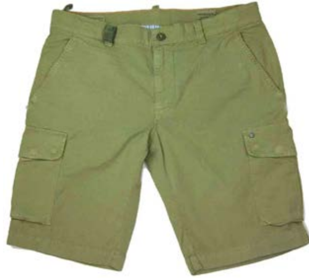
Bermuda cardo model in poplin cotton 139 Euro

The only thing to do is to trust your own instinct, a dive into one's own masculine DNA. It's in that solitary place where a bathing suit, a pair of Bermudas and a freshly cleaned T-shirt can have the same pleasure for the body as that first sip of cold beer on a sunny summer day.