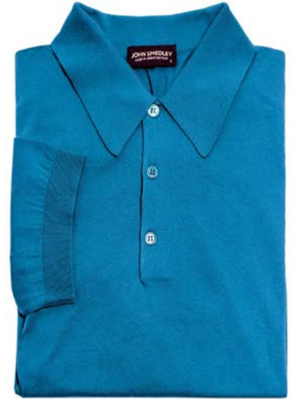
Sea Island cotton polo shirt short-sleeved solid color, available in various colors 189 Euro