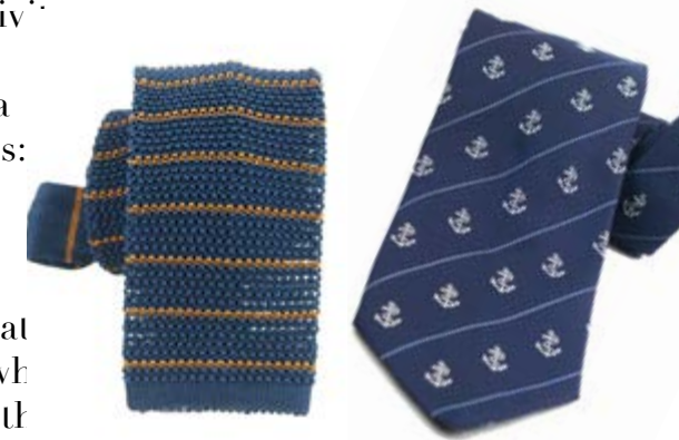
Crocheted striped silk tie with squared-off tip 65 Euro; Silk jacquard tie with navy design 69 Euro.